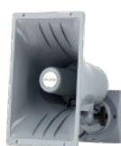
Algo 8186 IP Horn Speaker