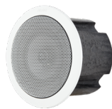
Algo 8188 IP Ceiling Speaker