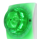
Algo 8138 IP Color Visual Alerter

Algo® is the registered trademark of Algo Communication Products Ltd. All other trademarks are the property of their respective owners.