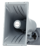
Algo 8186 IP Horn Speaker